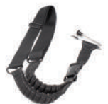
VP91 Carry Strap